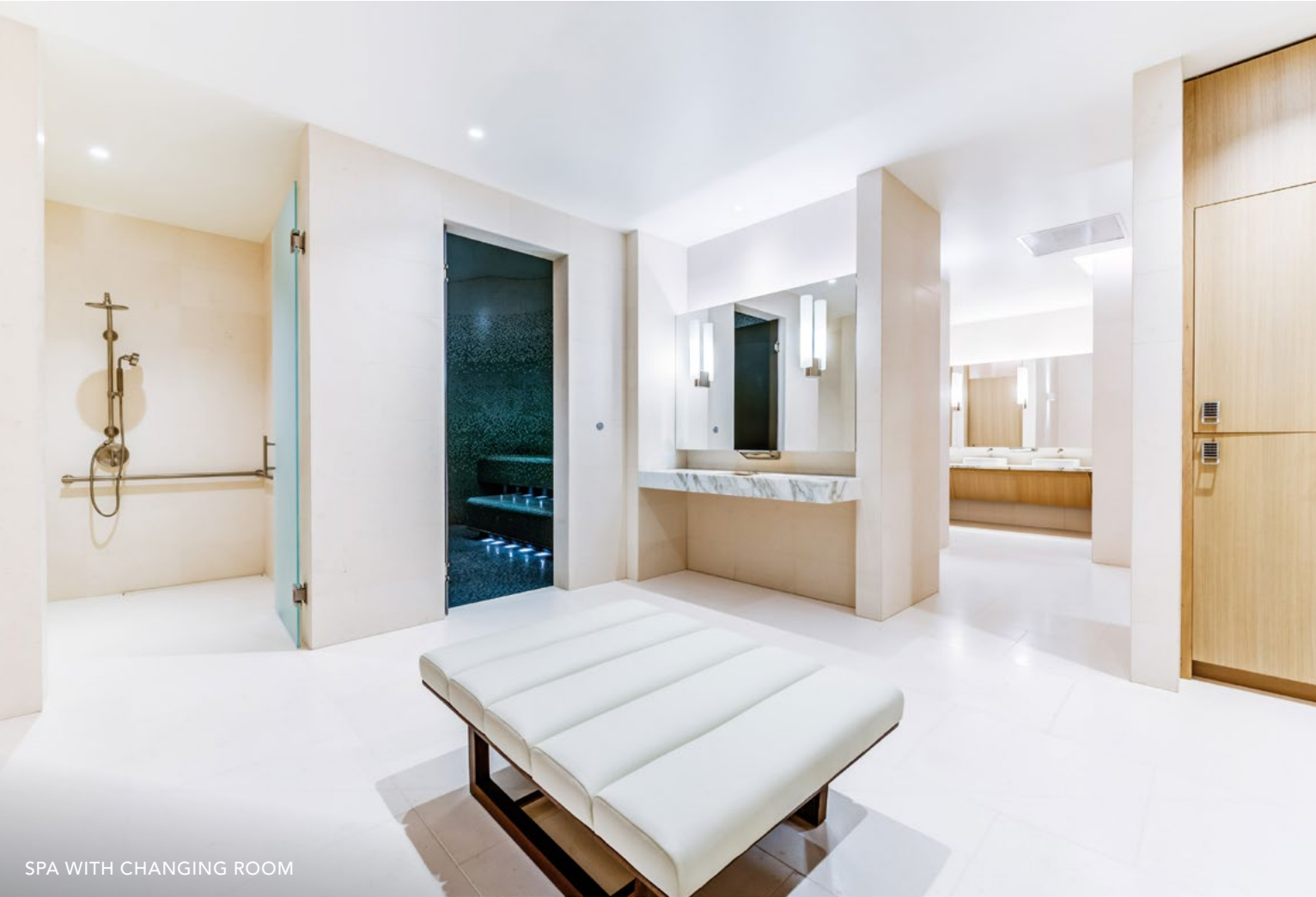
SPA WITH CHANGING ROOM