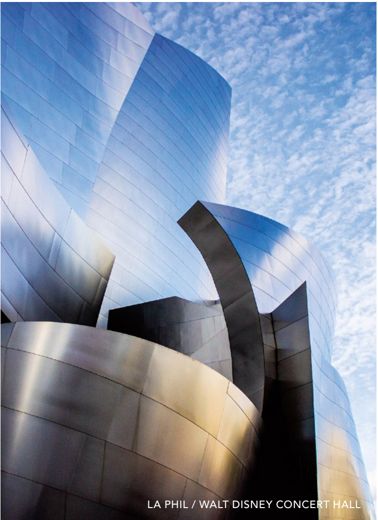
LA PHIL / WALT DISNEY CONCERT HALL