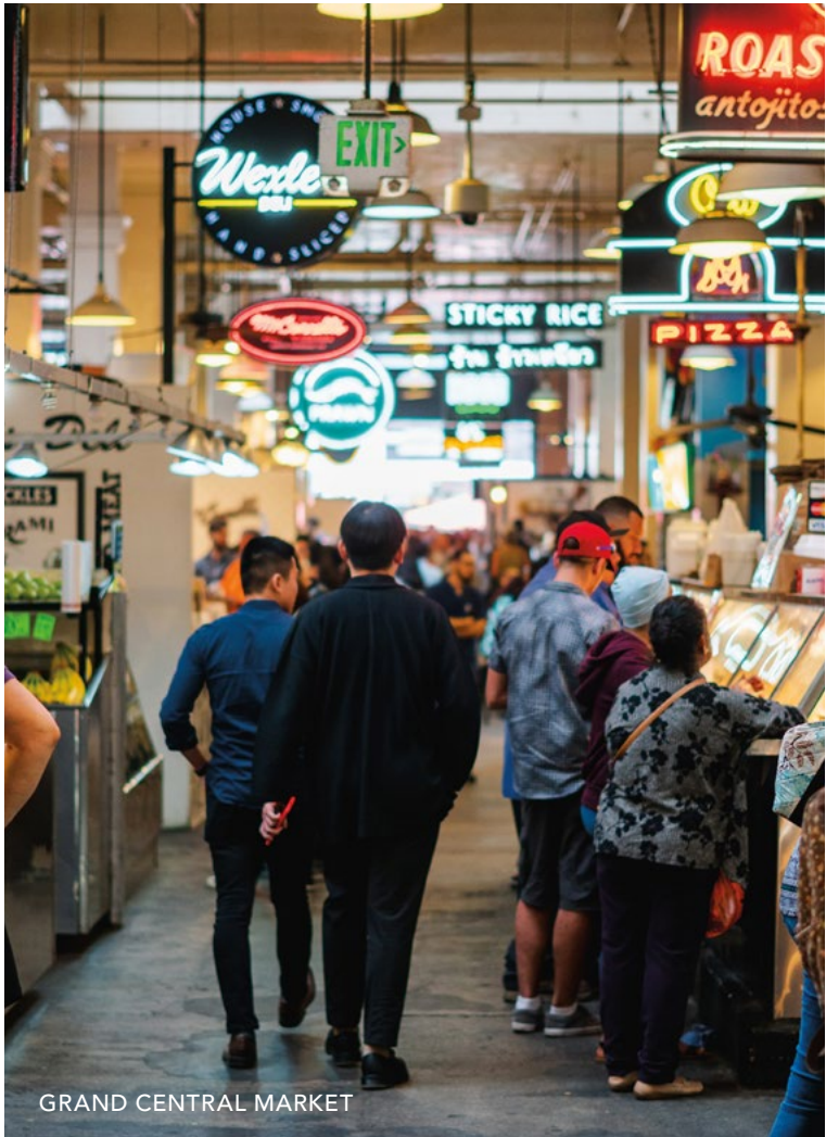
GRAND CENTRAL MARKET