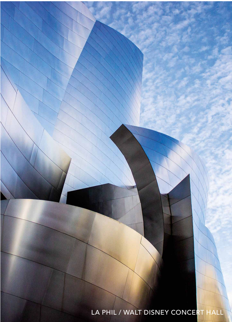
LA PHIL / WALT DISNEY CONCERT HALL