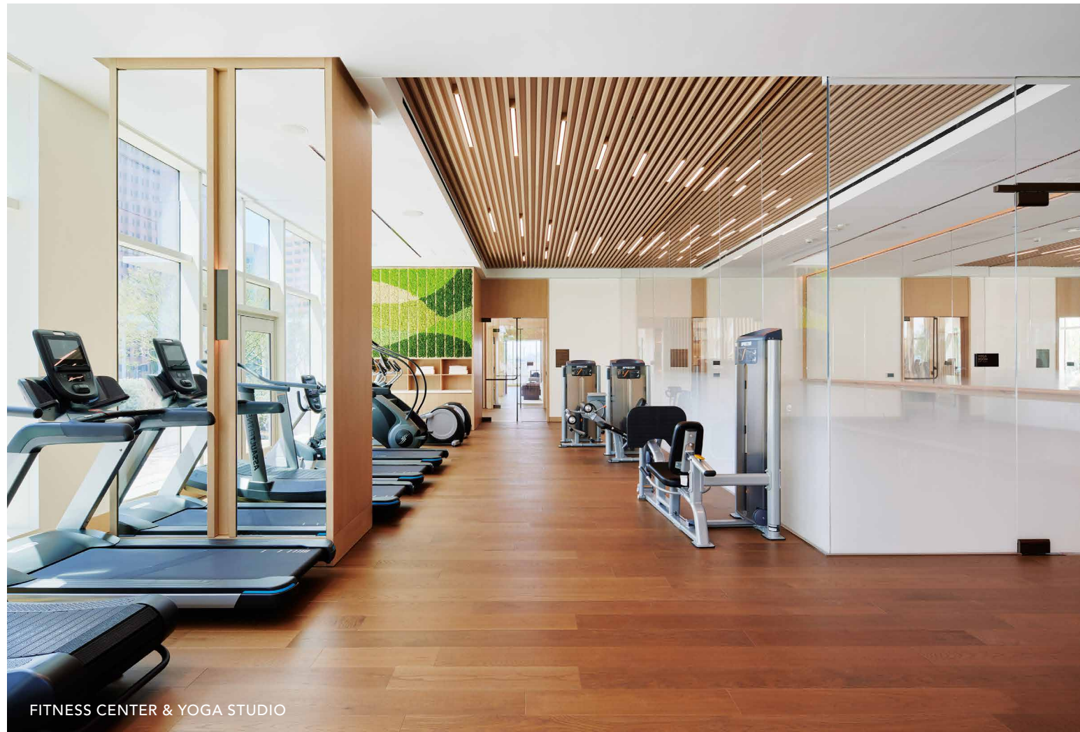
FITNESS CENTER & YOGA STUDIO