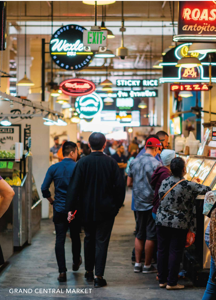
GRAND CENTRAL MARKET