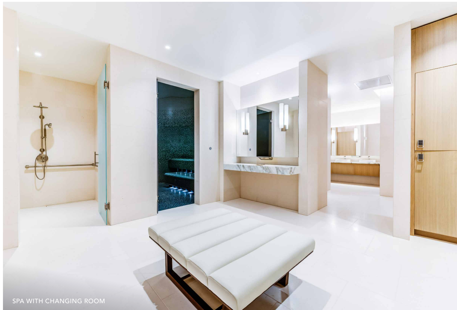
SPA WITH CHANGING ROOM